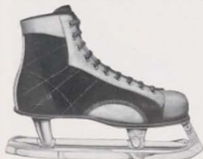
Per Pair Outfit No. 111, Shoe No. 273, C.C.M. Extra (Violet) $12.00 Outfit No. 119, Shoe No. 277, C.C.M. Model "D" ... $12.50