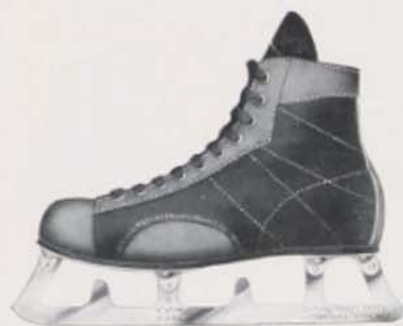
Per Pair Outfit No. 112, Shoe No. 277, C.C.M. Goalkeepers $15.00