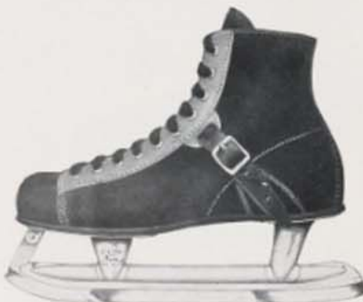
Per Pair Outfit No. 104, Shoe No. 273, C.C.M. Nemo Alum. $6.50