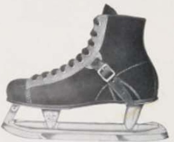
Per Pair Outfit No. 162, Shoe No. 272, C.C.M. Nemo Alum. $5.75