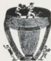
No. 1 or 11

No. 1. —Heavy 1-inch elastic waist band and heavy 2-inch elastic understraps. Size 2 small, medium and large. Retail price each .90