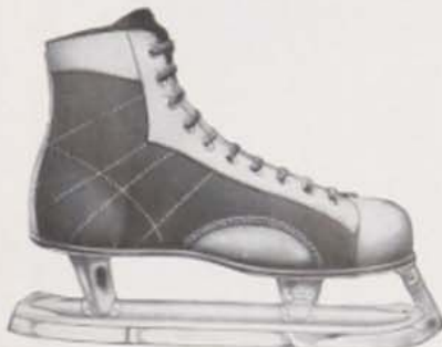
Per Pair Outfit No. 125, Shoe No. 234, C.C.M. Extra (Olive) $10.00 Outfit No. 126, Shoe No. 234, C.C.M. Model "D" ... 11.50