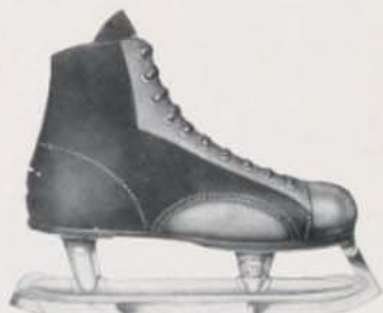
Per Pair Outfit No. 142, Shoe No. 274, C.C.M. Cyeu Alum. $7.75