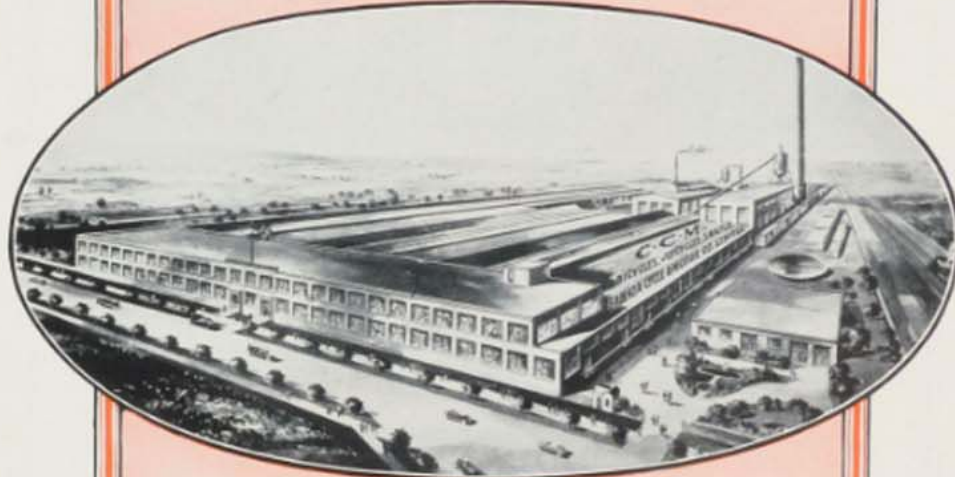
The C.C.M. Head Office and Factory at Weston, Ont., which maintains a remarkable standard of efficiency and service.